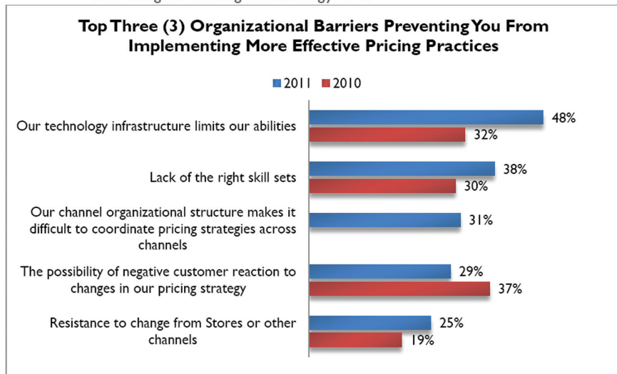
The Tangled Pricing Technology Web

“Retailers in these categories want to take advantage of the business intelligence we’re bringing to